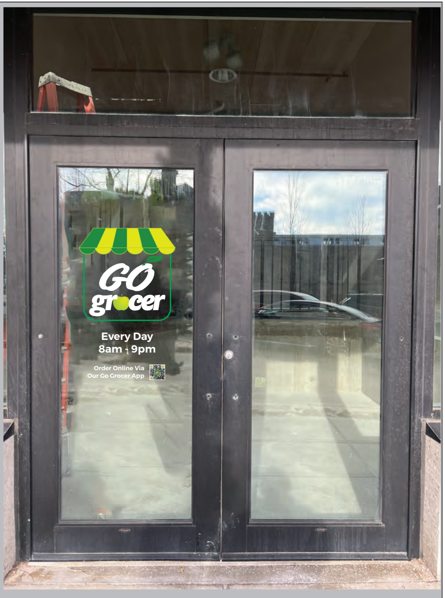
19" w x 30.2" h size print-to-cut vinyl graphics installed to left window (quantity 1)

CUSTOMER: Edgar Rivera COMPANY: Go Grocer COREBRIDGE #: 58626