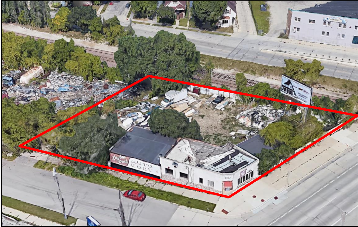
3322 W. FOREST HOME AVE. (EXISTING)