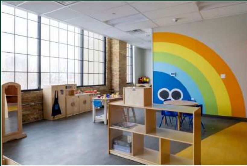
Ebenezer Child Care occupies 2.5 floors