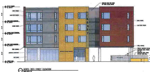
35 th Street Elevation