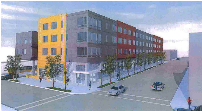
Rendering from 34 th & Villard

The Villard Avenue Library will relocate to the ground floor from its free-standing location at 3310 West Villard. The library will contain approximately 12,000 SF and will have use of a 32-car surface parking lot along the alley. The library entrance will be at the corner of 35 th & Villard. The Library and Department of City Development staff must approve the design and construction specifications for the library. The developer will finish the library to a "grey box" condition and the City shall be responsible for the interior build-out. The City shall be consulted on proposed contractors.