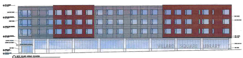
Villard Avenue Elevation