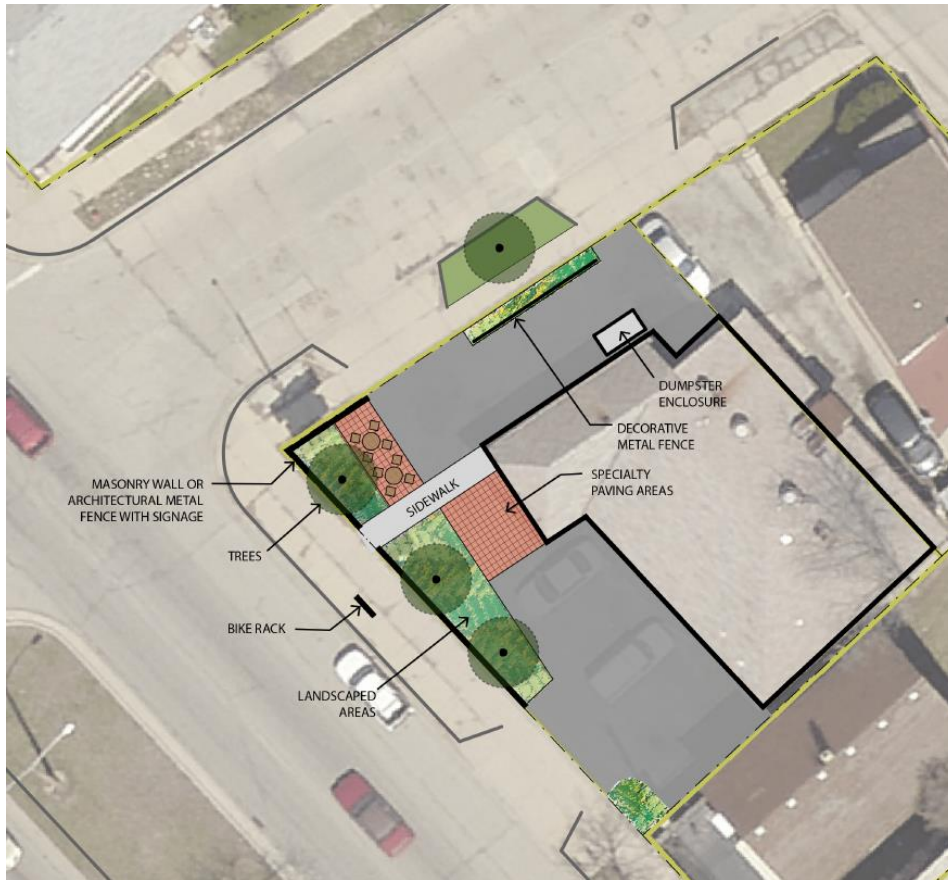
CONCEPTUAL LANDSCAPE DESIGN