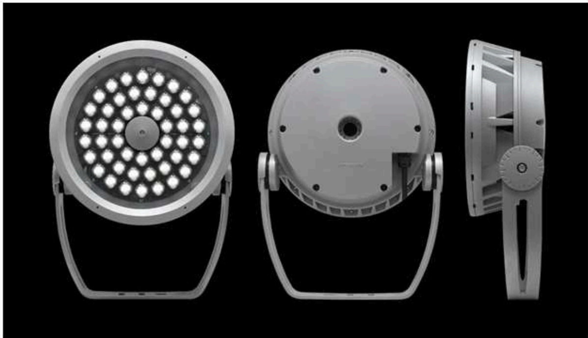
Lumenbeam Flood Light