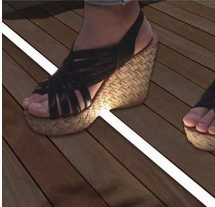
LED Strip Lighting