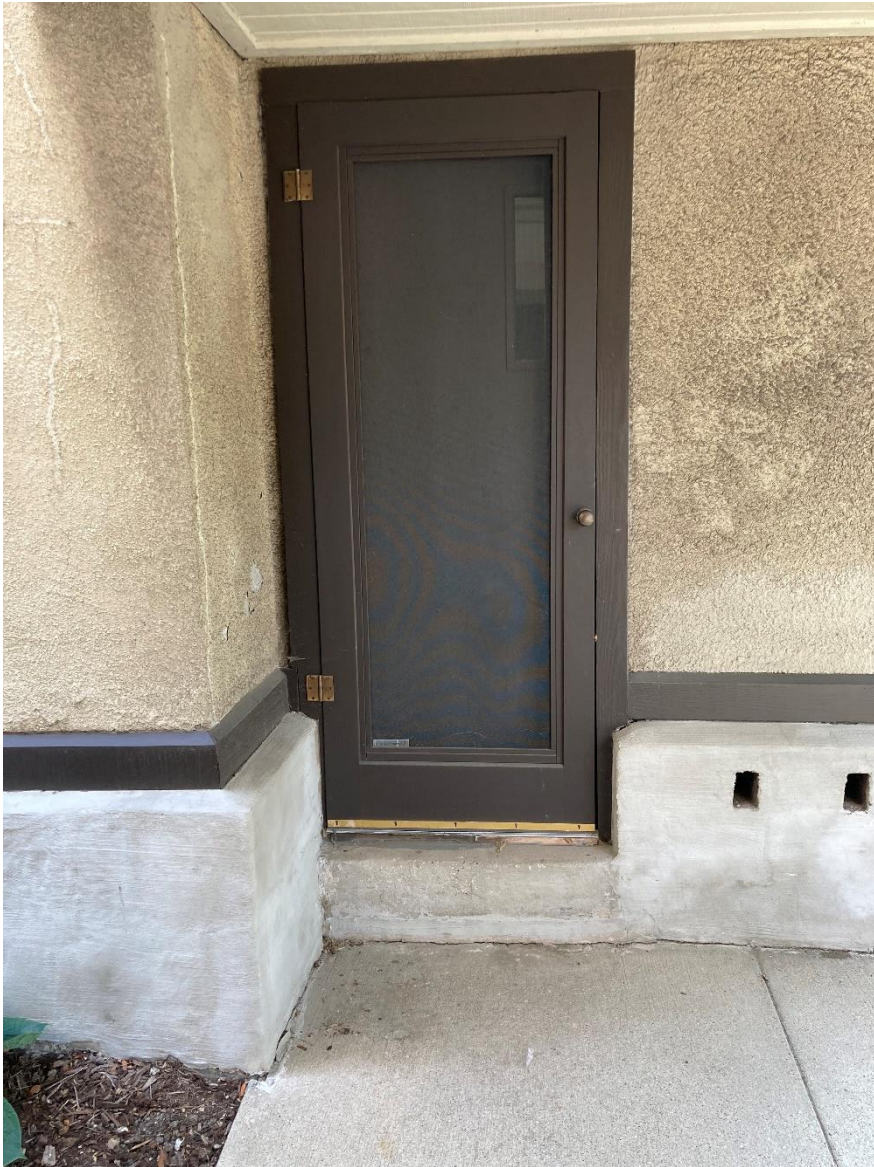
Location of temporary step