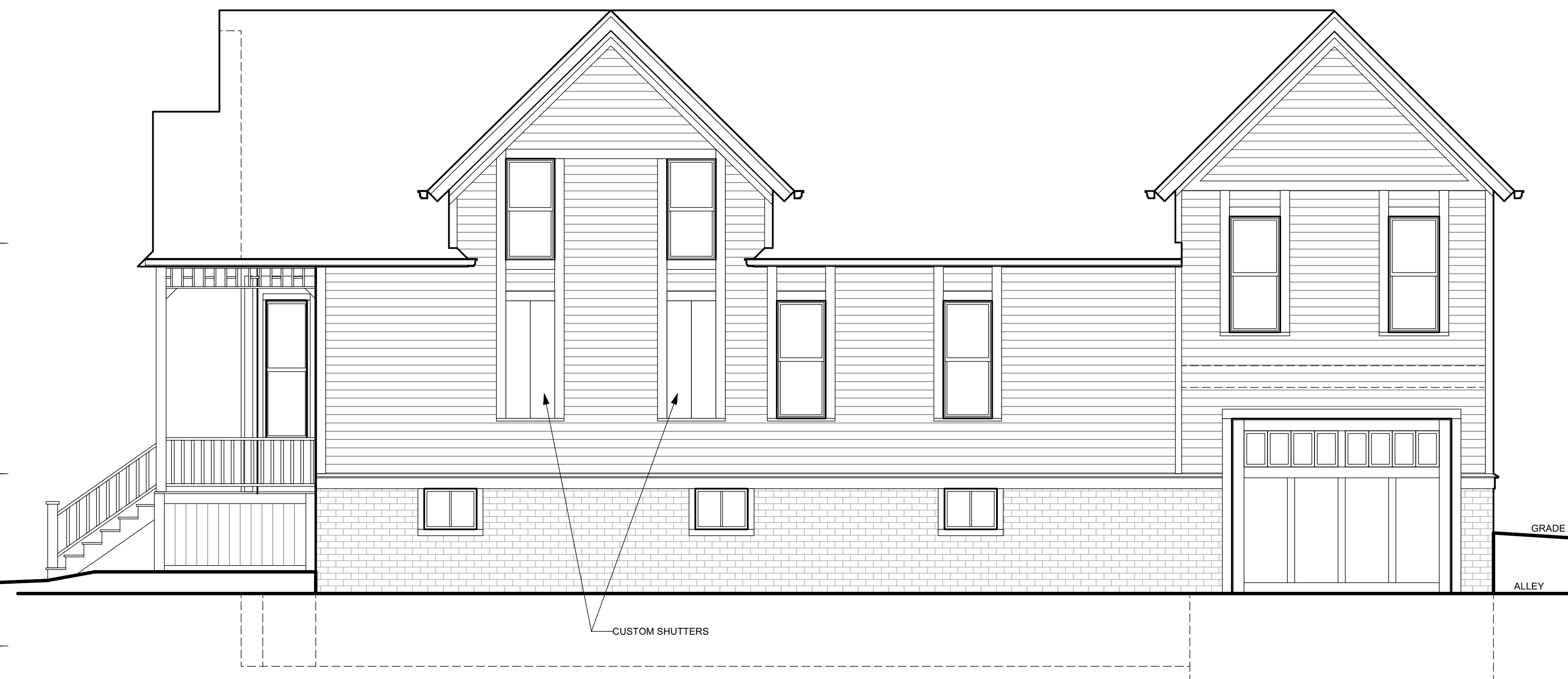
4 PROPOSED SIDE (WEST) ELEVATION - (ALLEY VIEW) SCALE: 1/4" = 1'-0"