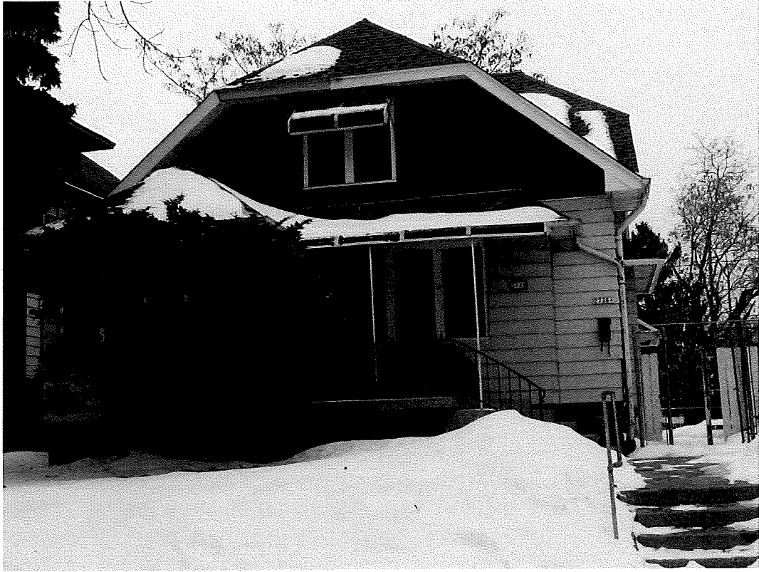
2736 North 53 rd Street