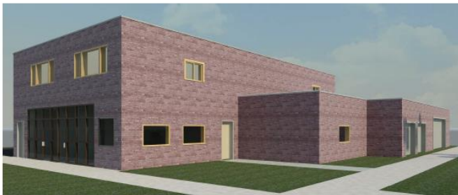
3D View 2.1 Scale: 1/8" = 1'-0"