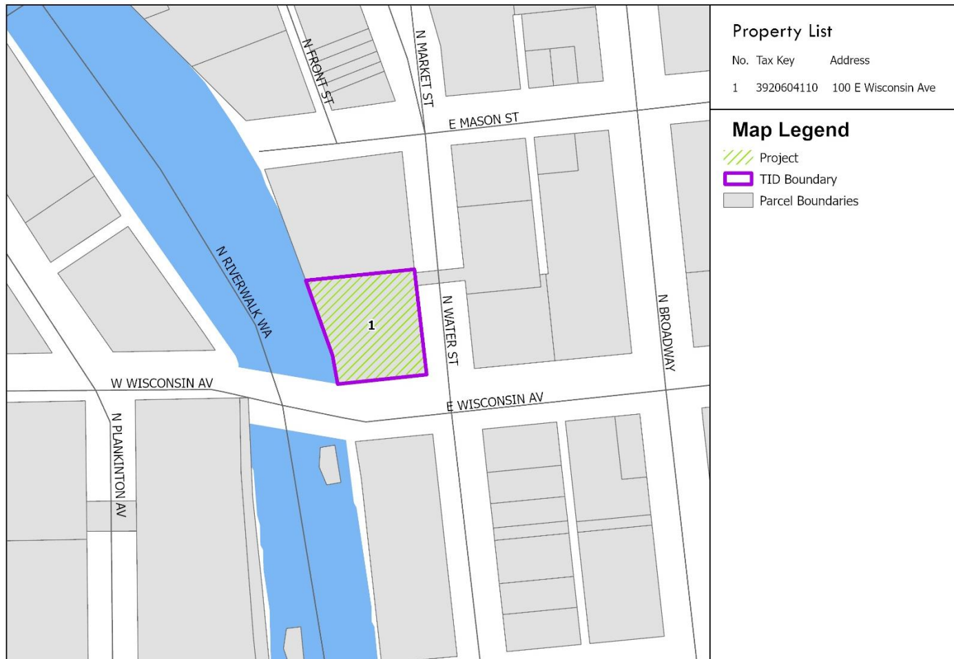
TID 127, Map 3: 100 East Wisconsin Proposed Uses and Improvements