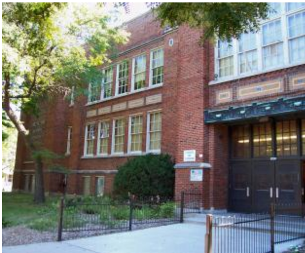
Green Bay Avenue School

Excess capacity repurposed for use by high-quality charters