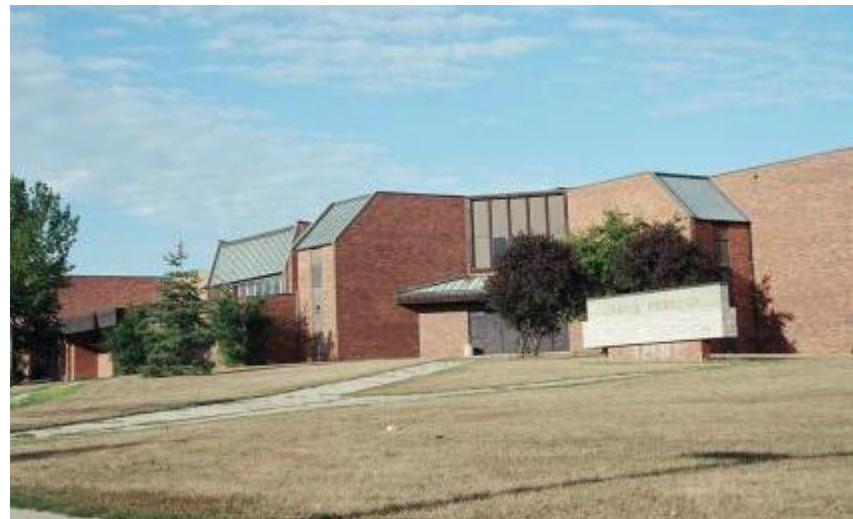
Webster Middle School

Leased to Universal Charter Schools, a national charter school organization