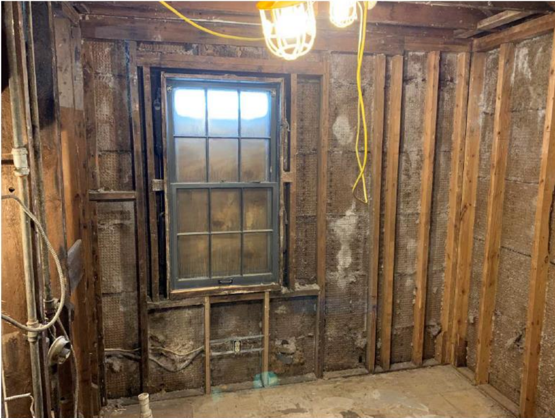
45 45-IMG_2338 Date Taken: 4/20/2021