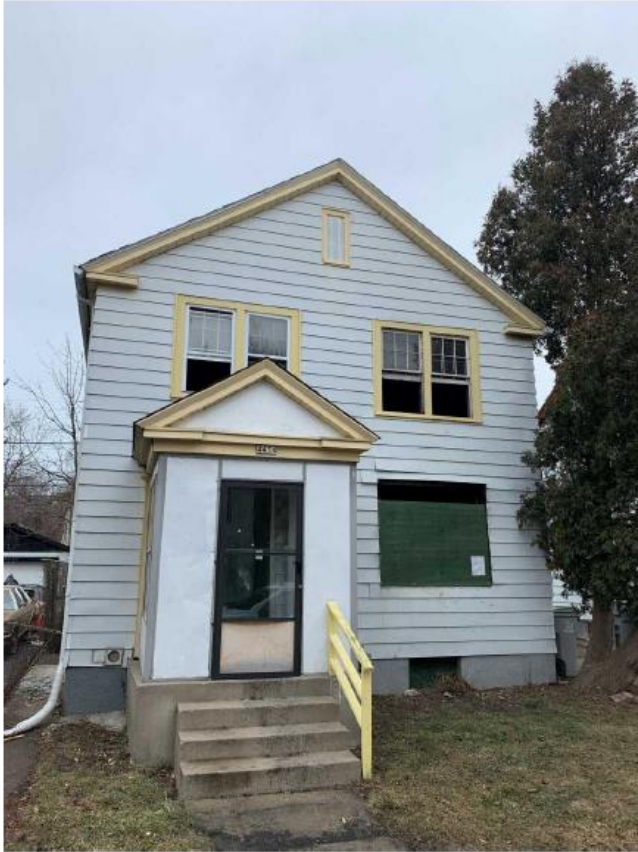
Date Taken: 3/10/2021