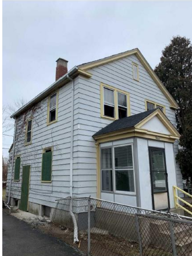
Date Taken: 3/10/2021