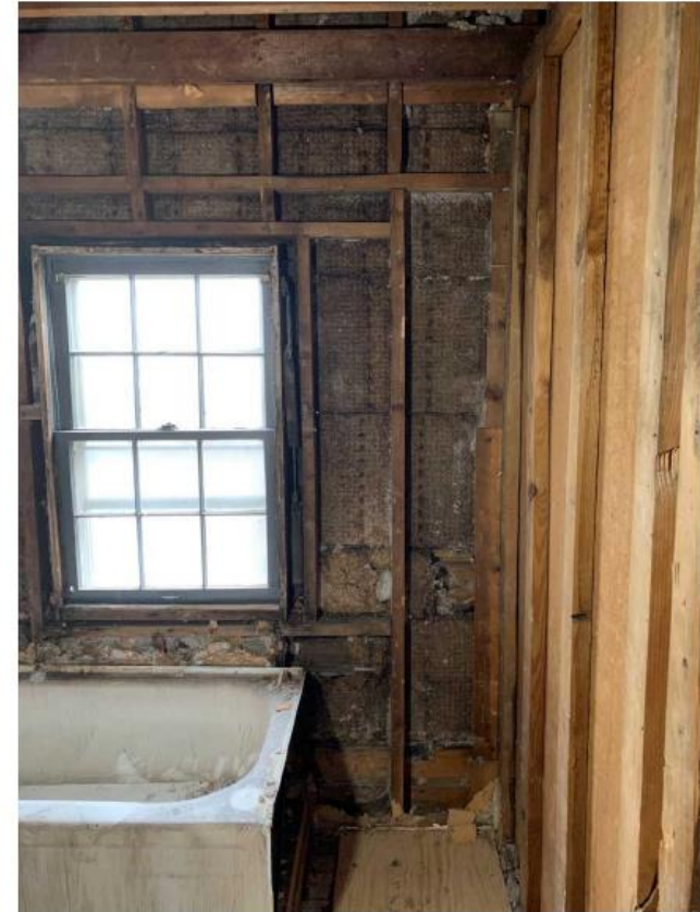
101 101-IMG_2402 Date Taken: 4/20/2021