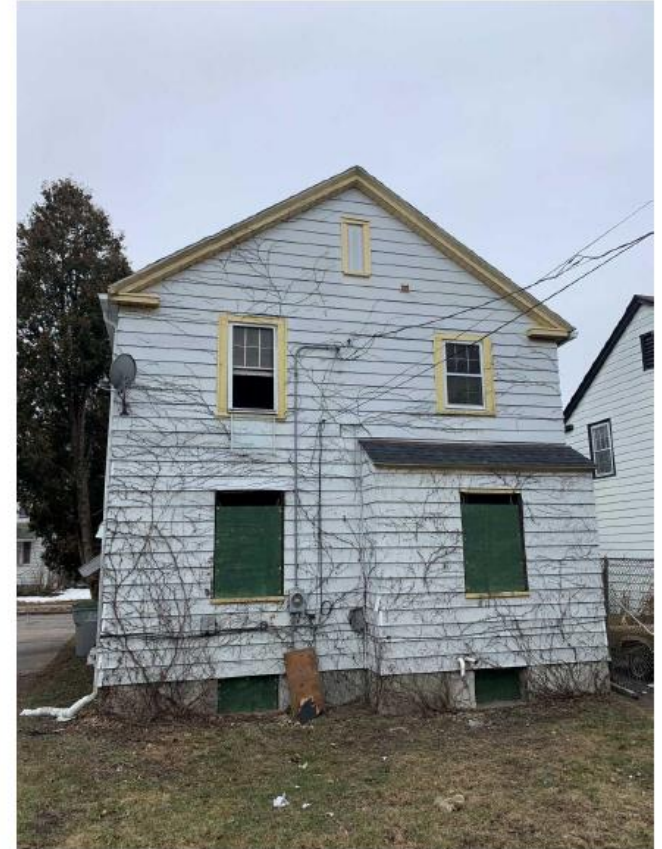
Date Taken: 3/10/2021