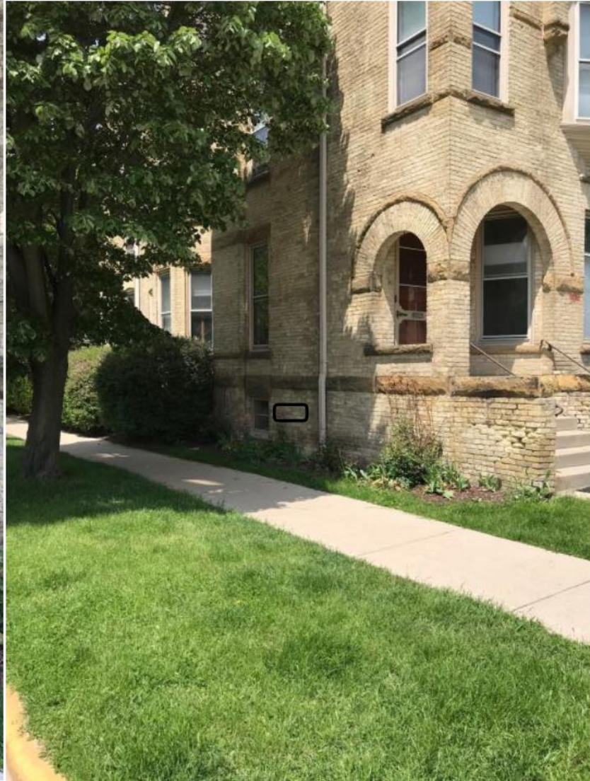
View of the property looking northwest