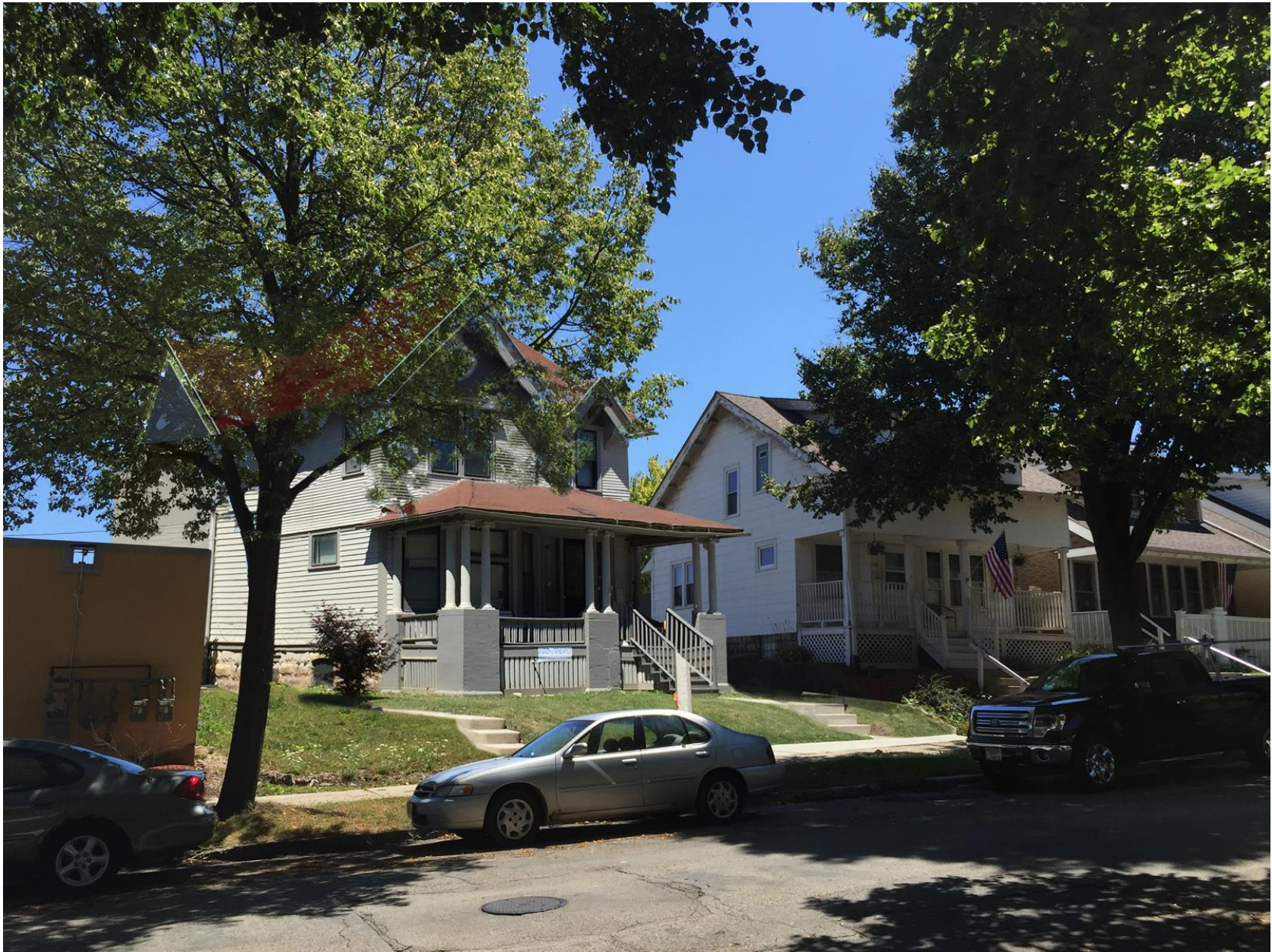
Artist's rendering of house at new location