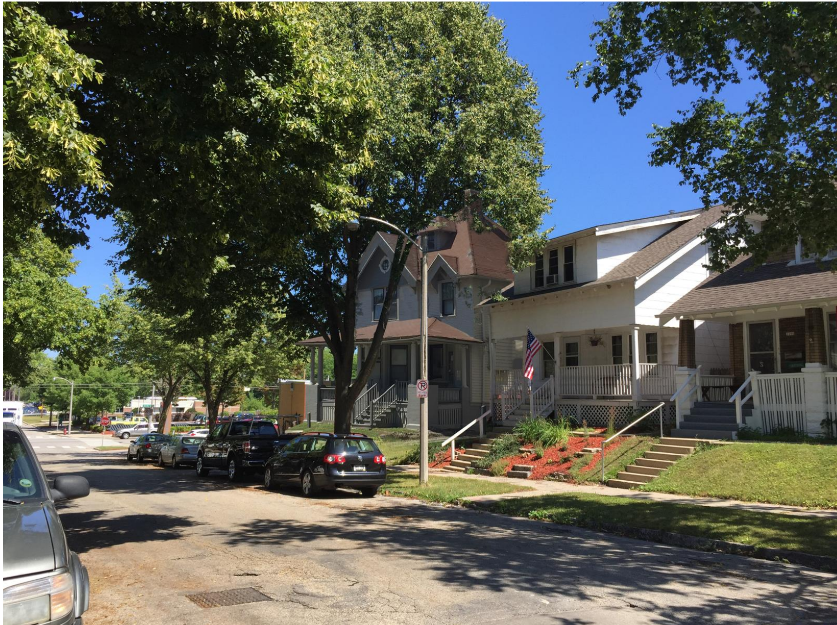
Artist's rendering of house at new location