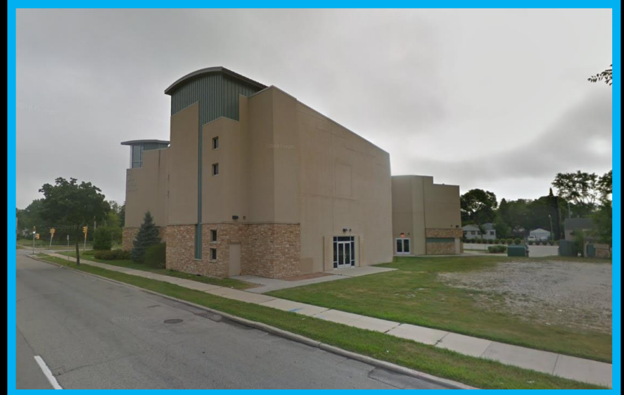
View from North 60 th Street looking north-east