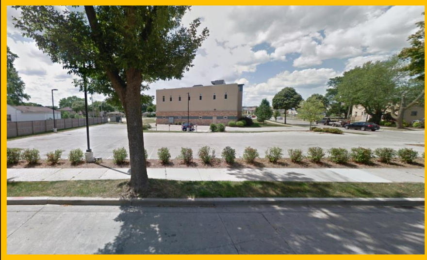
View from North 58 th Street looking west