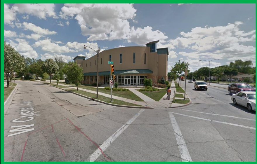
View from Custer Ave and 60 th Street looking south-east