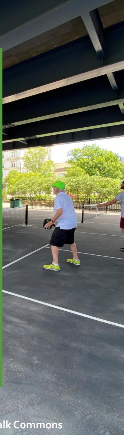
Pickleball at Riverwalk Commons

'Brighten the Passage' won a 2021 International Downtown Association Award of Excellence.