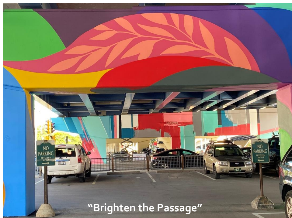
"Brighten the Passage"