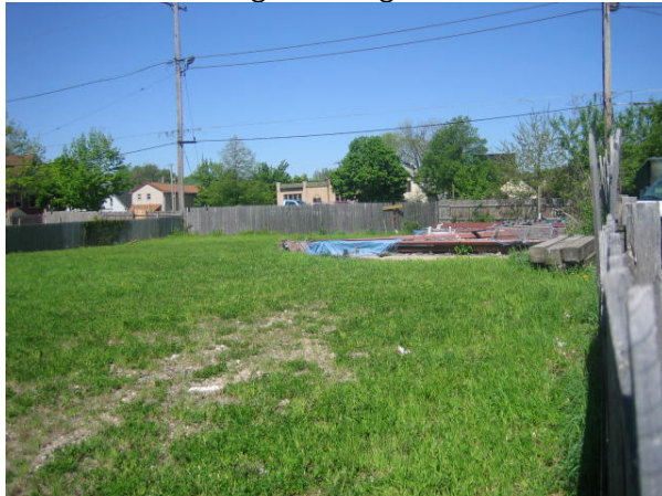
View From Muskego looking SW