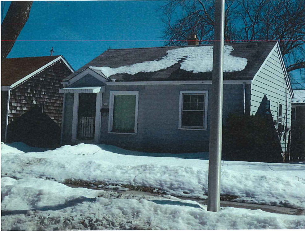
4728 North 22 nd St