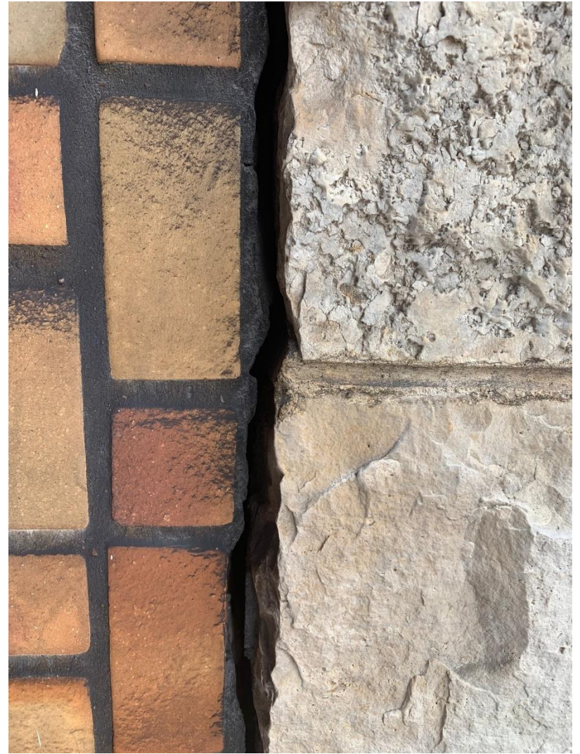
Areas to be repointed and repaired