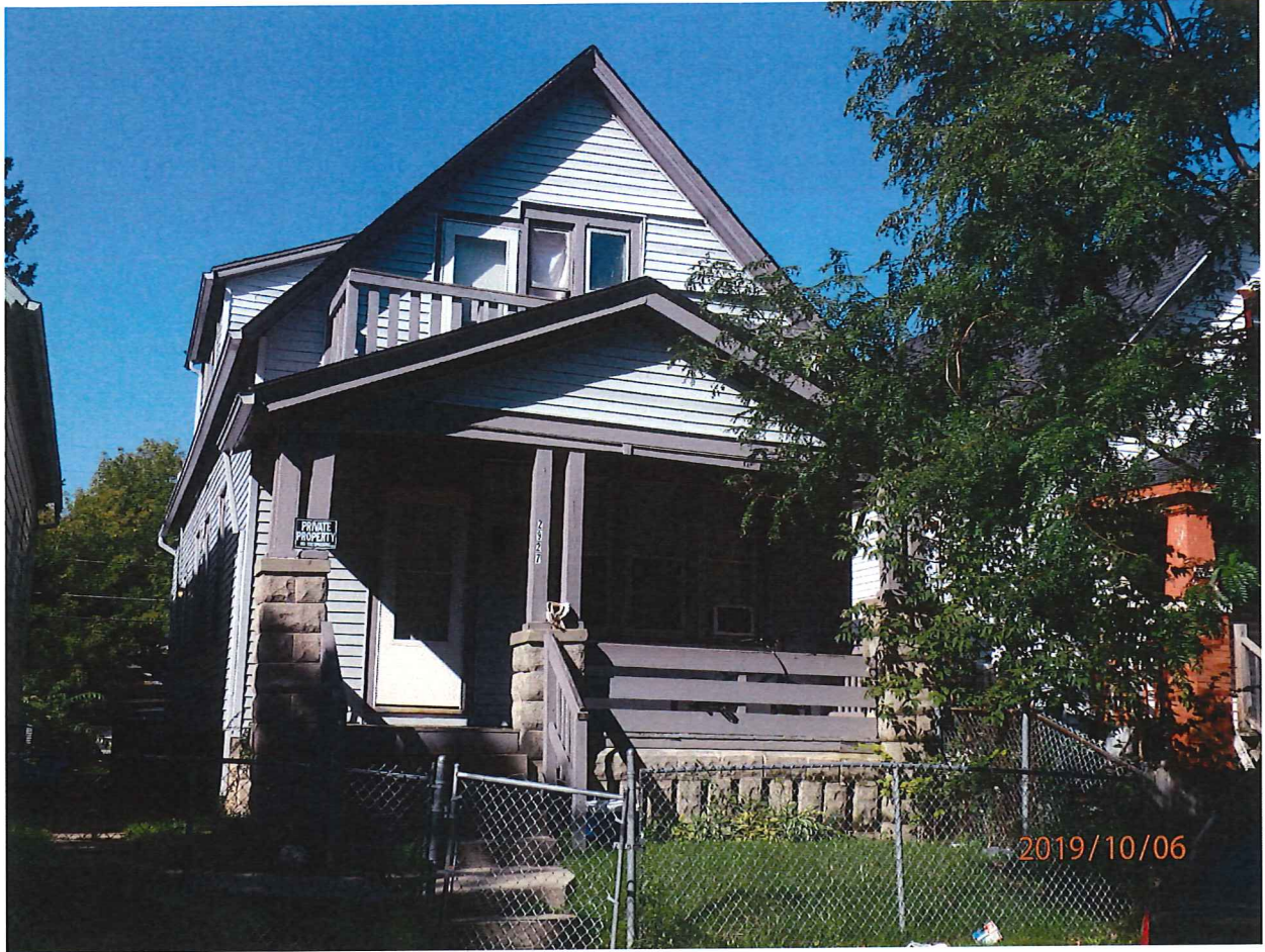
2927 North 21 st Street