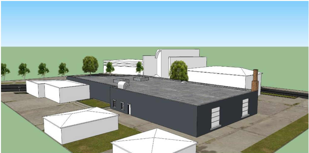
Right view of property