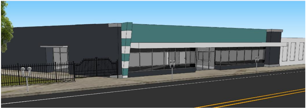
Front view of property