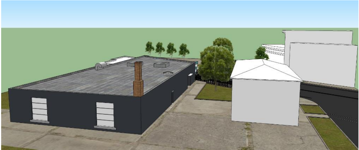
Left view of property