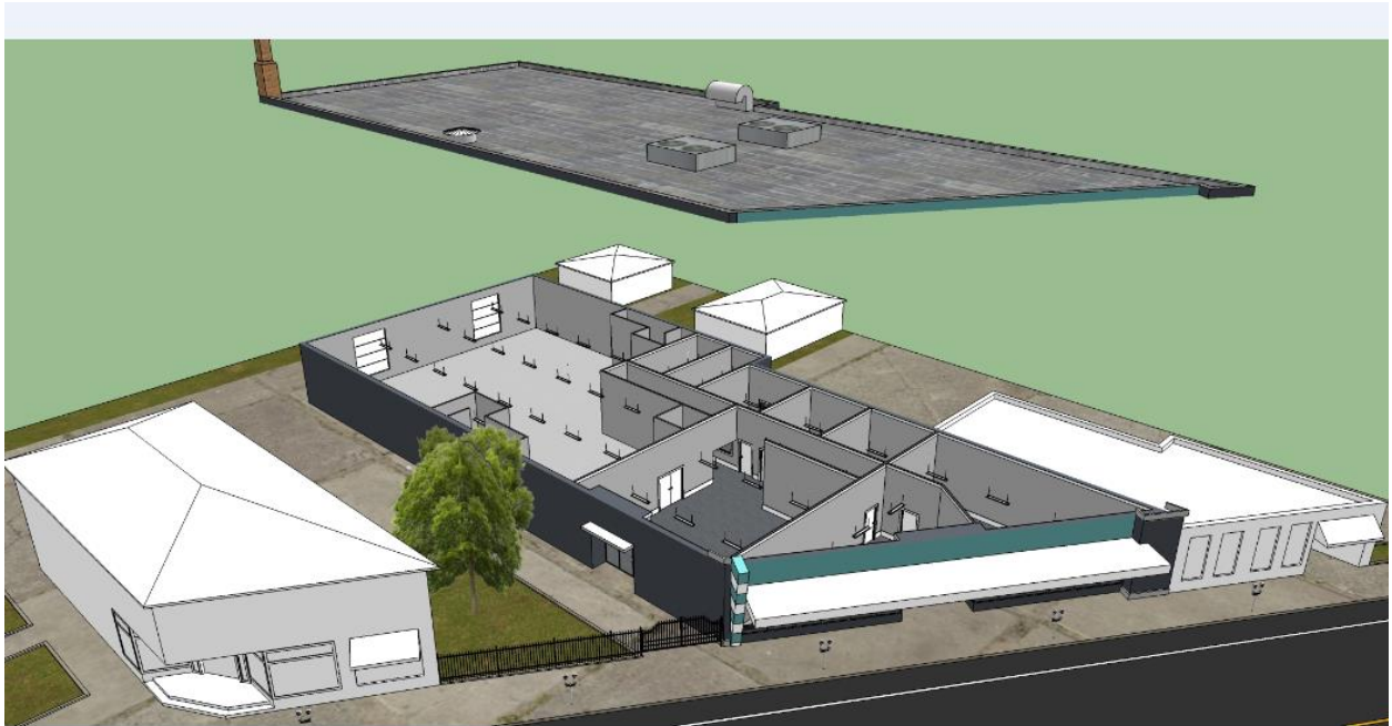
No roof - Left view