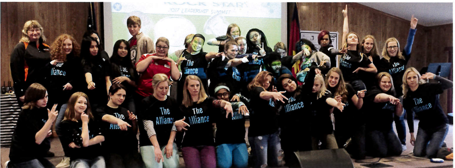
In April, members of MCSAP attended an AWY Youth Summit in East Troy to learn more about the importance of preventing drug, tobacco, and alcohol use among youth.