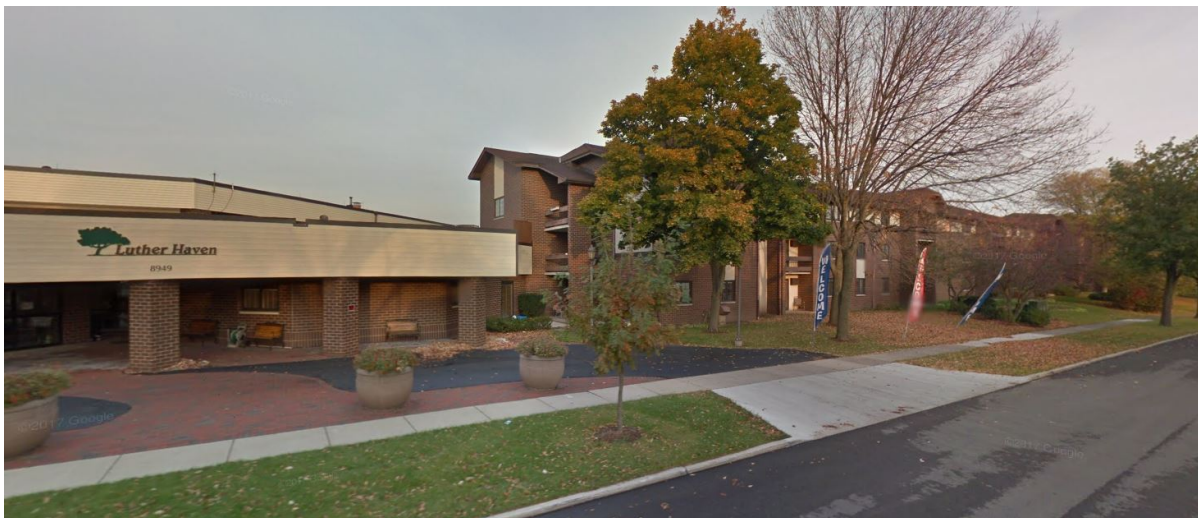
Structure of main lobby/entrance and apartment building (along eastern property line bordering N. 97th Street)