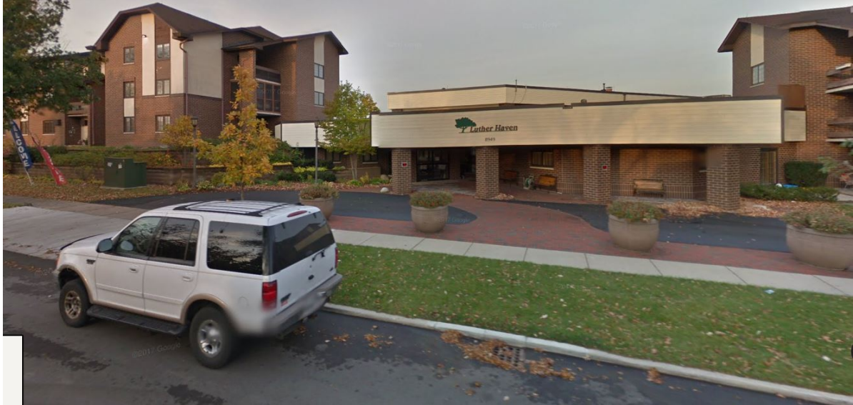
Structure of main lobby/entrance (along eastern property line bordering N. 97th Street)