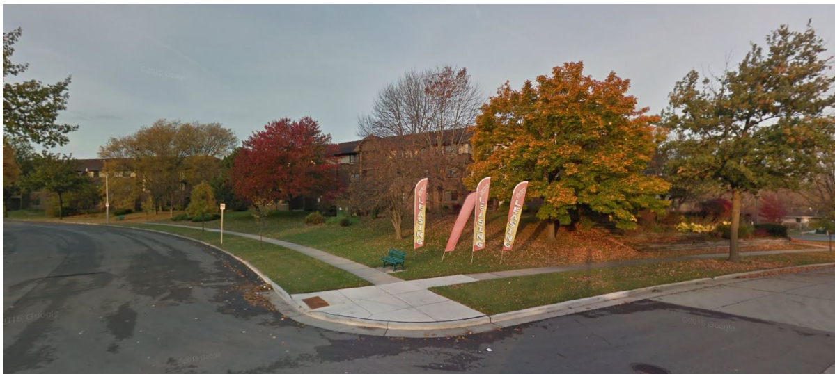
Apartment buildings and landscaping (northeastern corner of property (intersection of N. 97th Street and N. Michele Street))