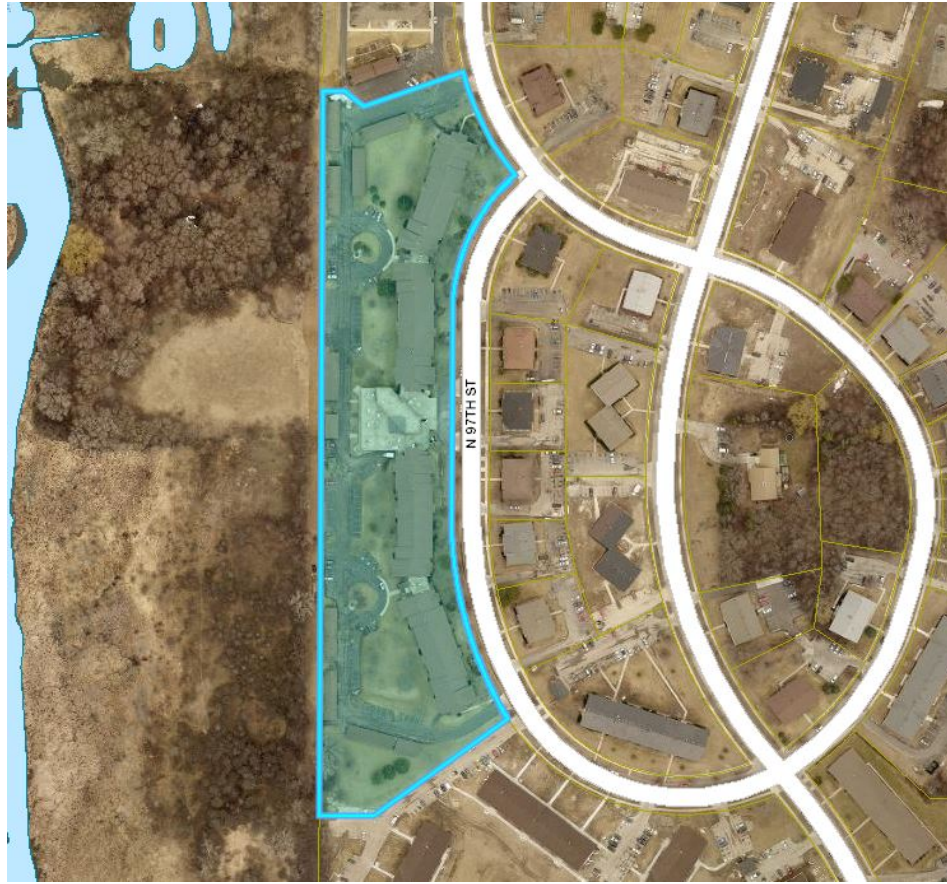
EXHIBIT A - VICINITY MAP