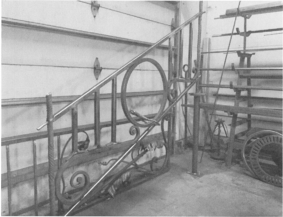
Revised Handrail partially complete