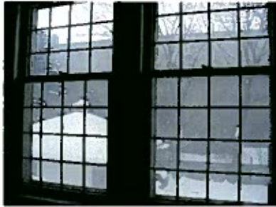
Going up the Stairs