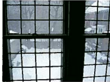
Going Down the Stairs