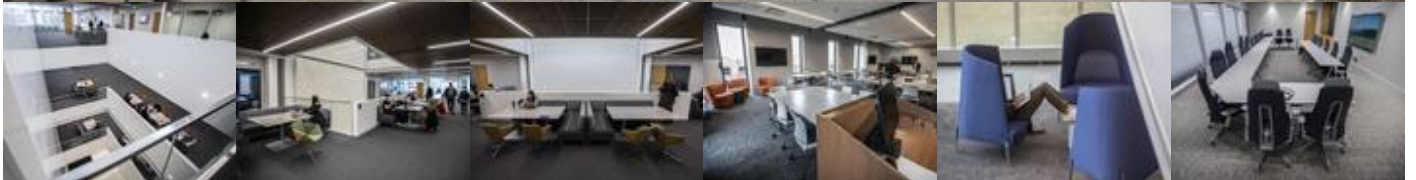
The facility houses the College of Business Administration.