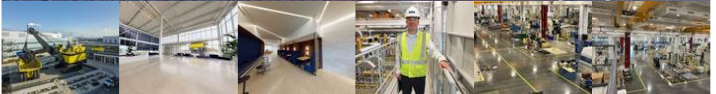
Komatsu Mining's $285 million office and plant complex in Milwaukee's Harbor District.