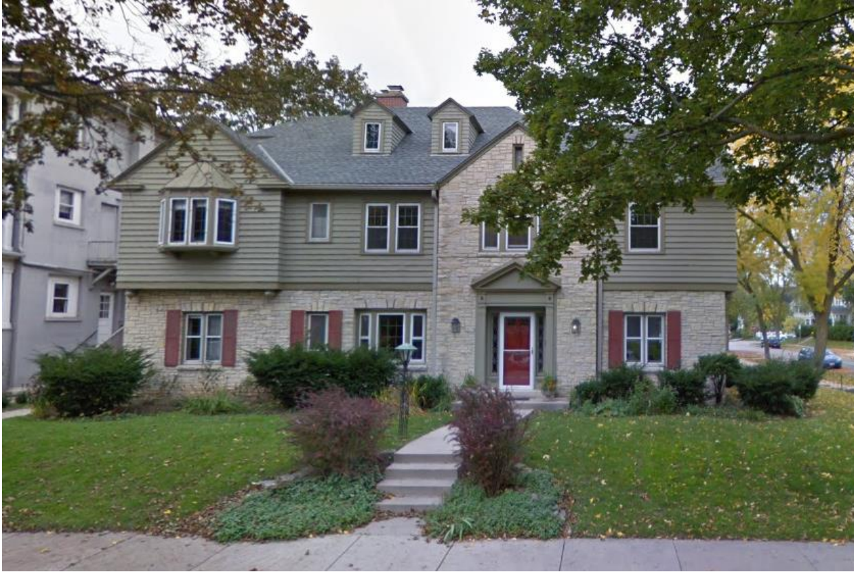
(Above) Condition of the property in Oct. 2016