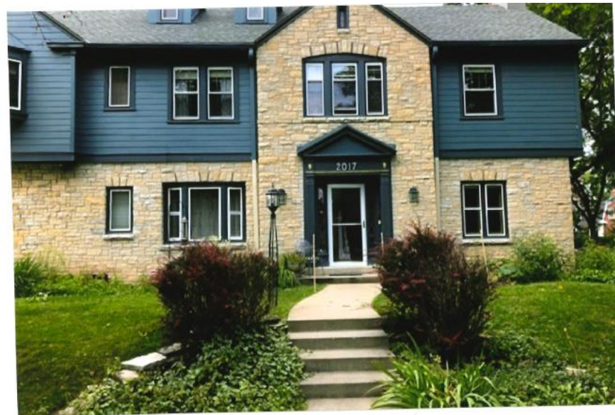
(Right) Present condition of the property