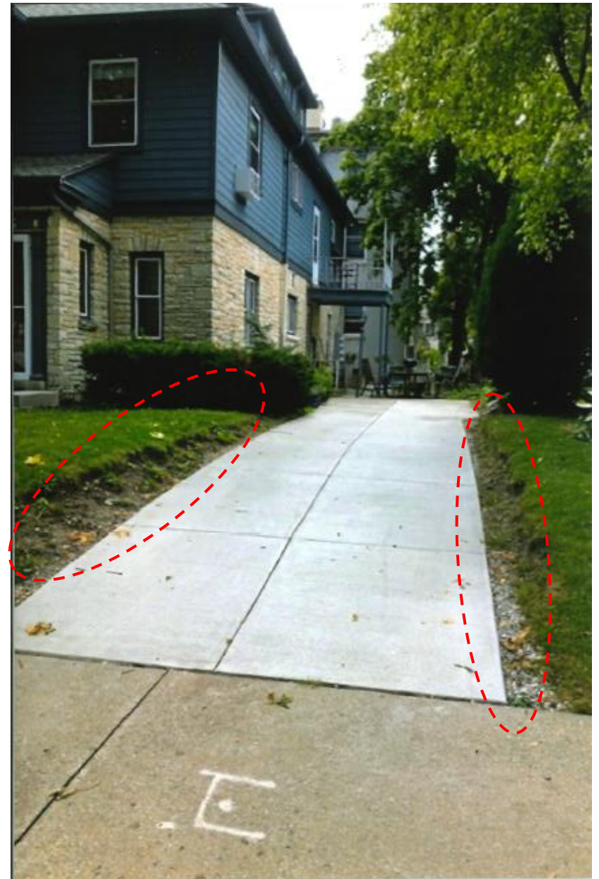
(Right) The driveway from Woodstock Pl. will be regraded along the sides where indicated above and filled in with seed or sod

The entire lawn will be improved with either seed or sod