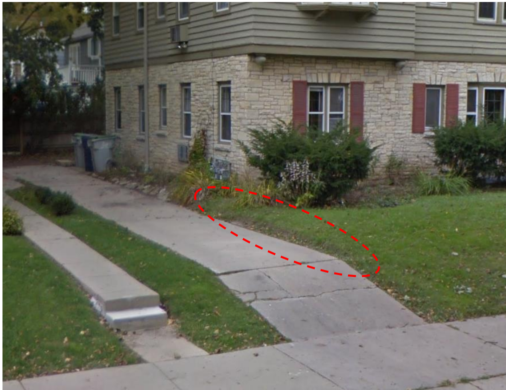
(Above) The driveway from Terrace Ave. will be regraded along the sides where indicated above and filled in with seed or sod