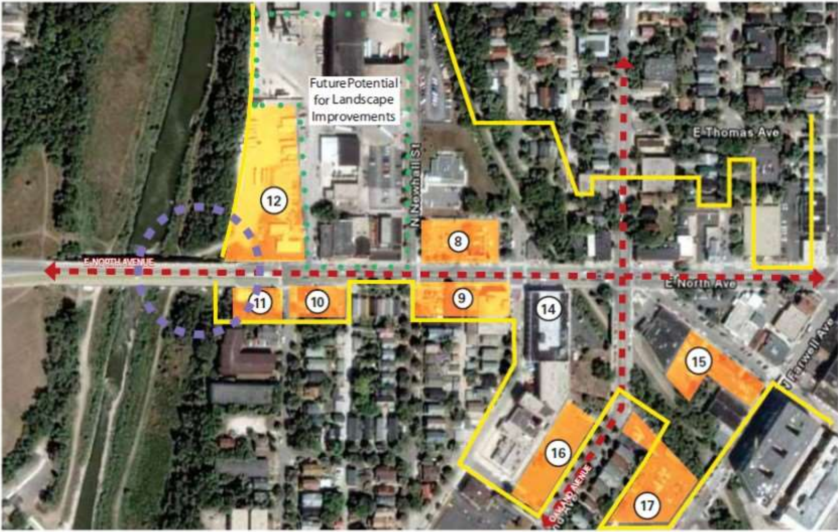
Figure 10.5: East Side BID and North Avenue commercial corridor from the Milwaukee River to Oakland Avenue.