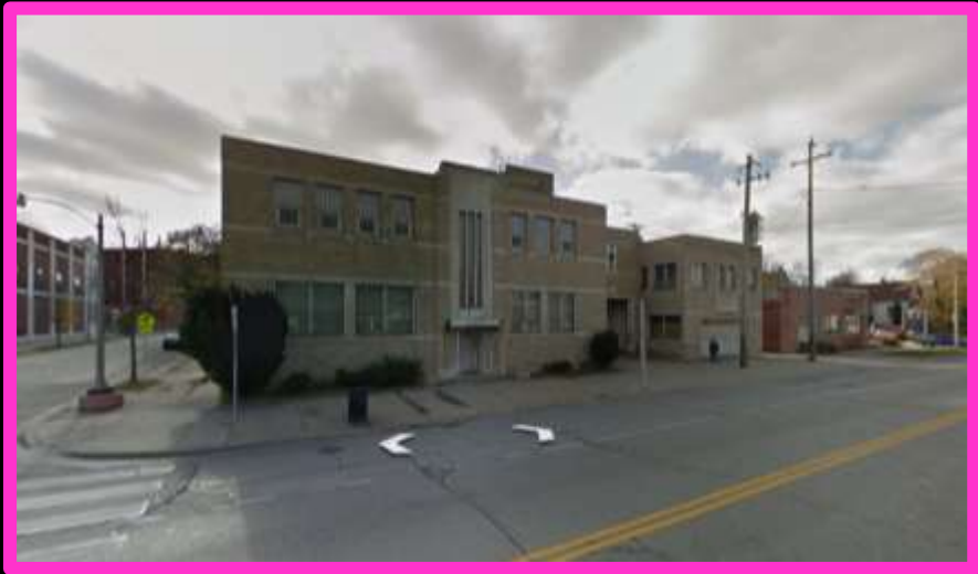
View from E. North Av. looking southeast