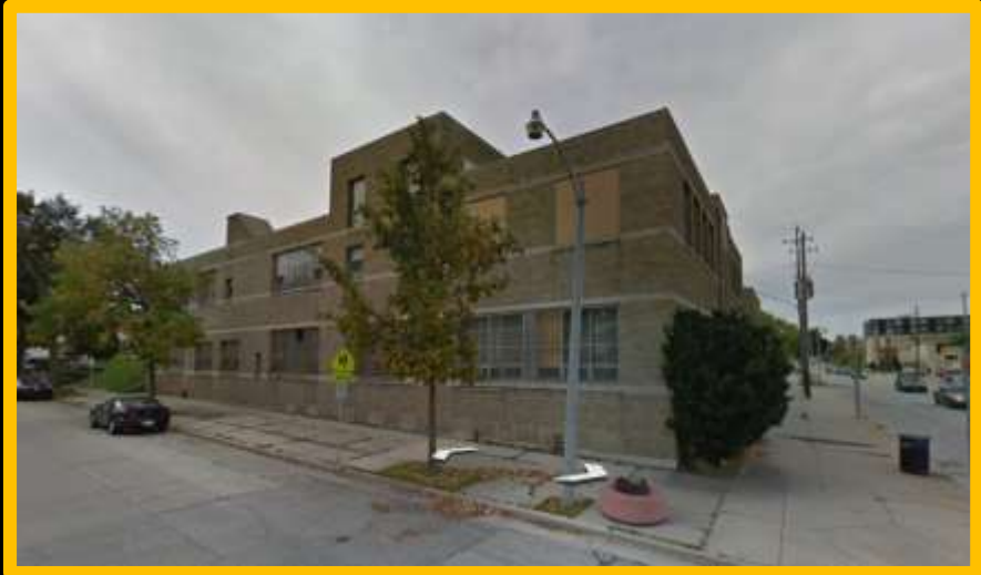
View from E. North Av. looking south