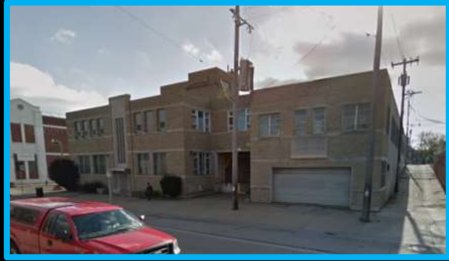
View from E. North Av. looking west