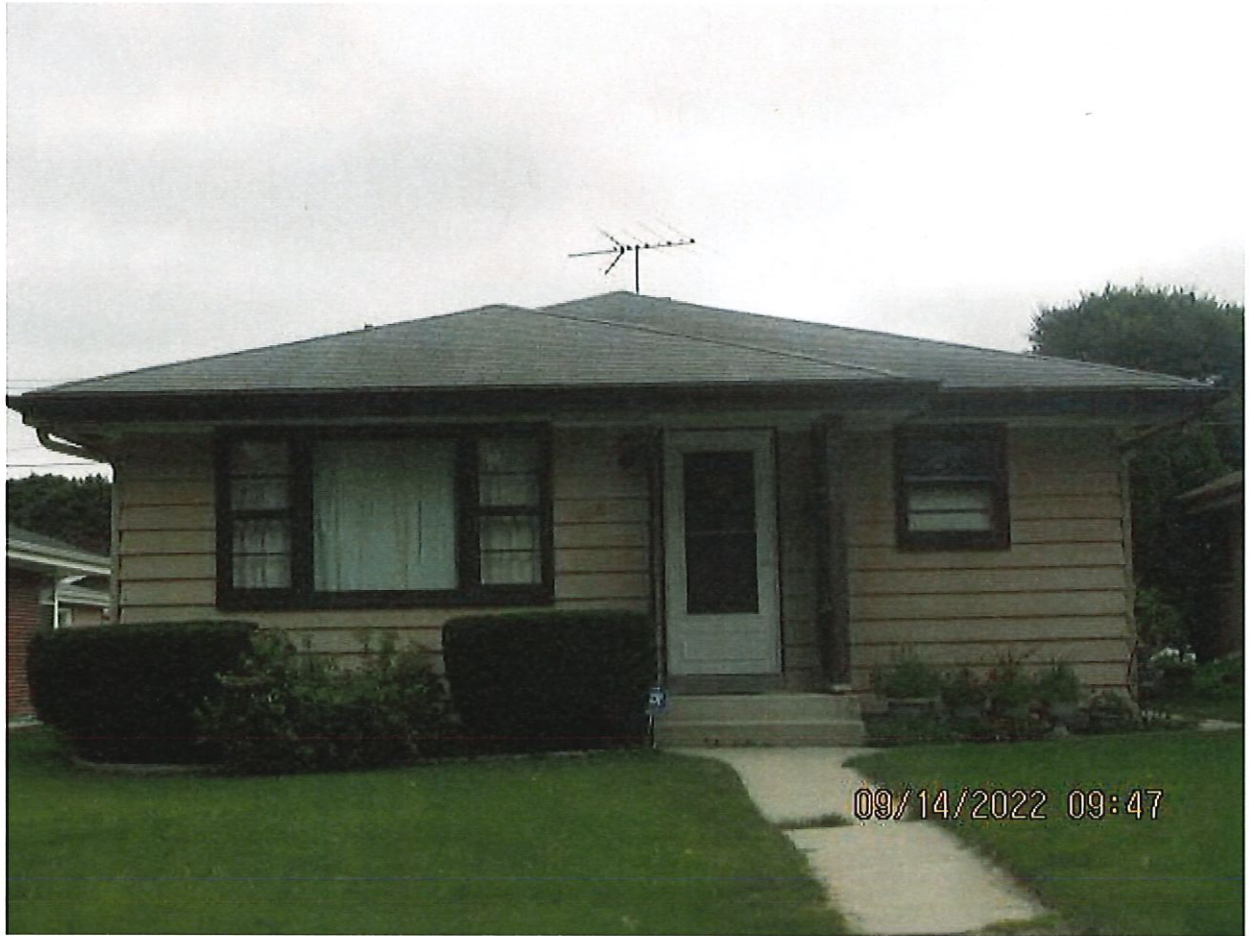
4160 North 83 rd Street