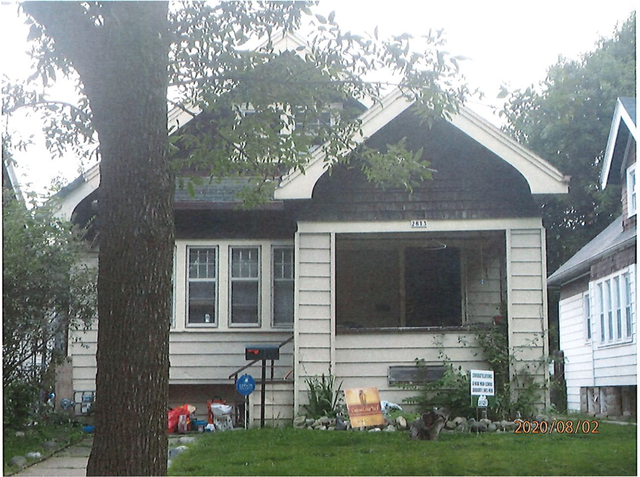
2813 North 36 th Street