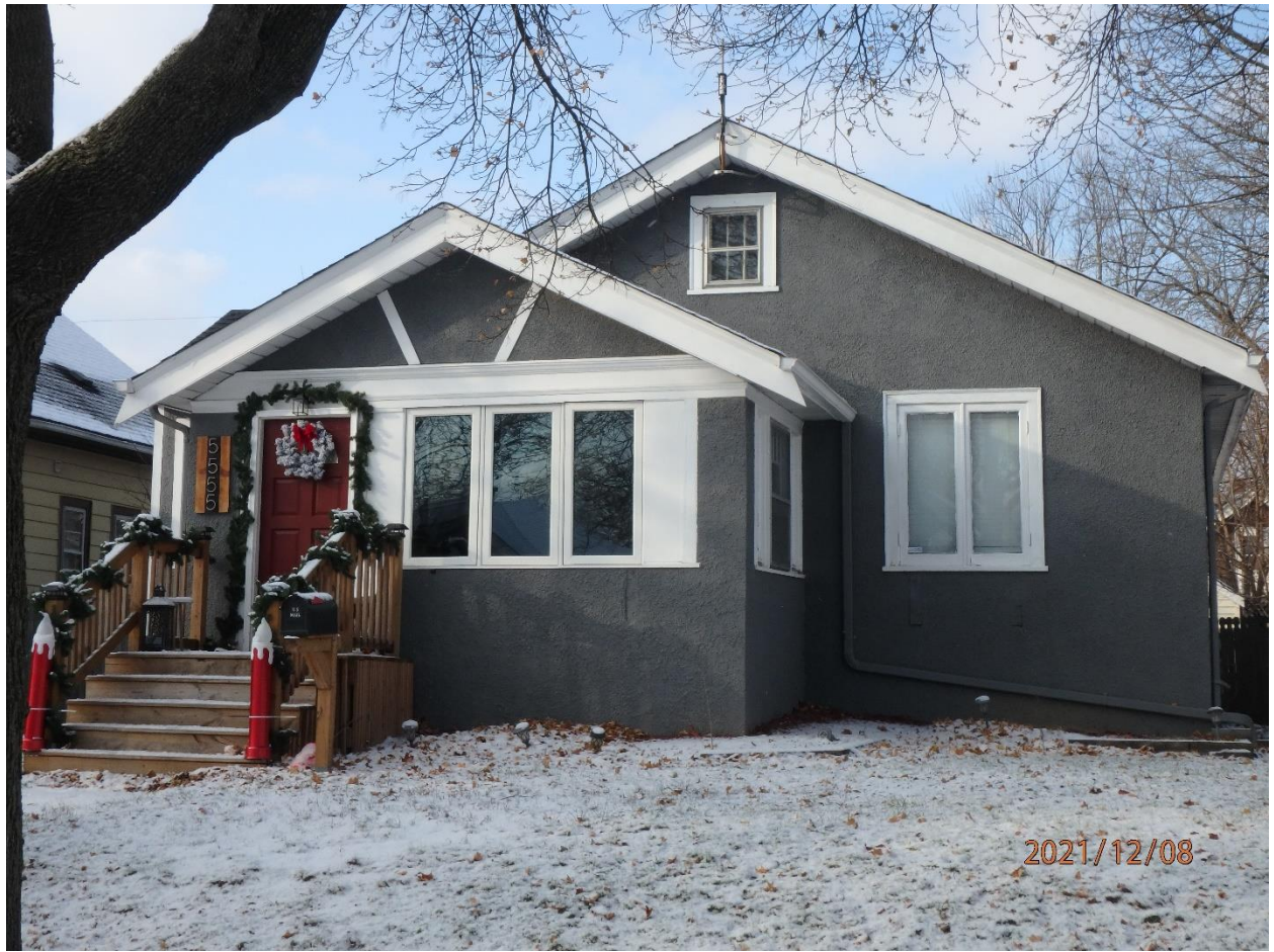
5555 north 41 st street