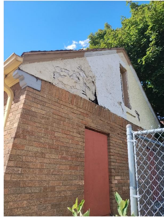
Existing garage roof and stucco conditions