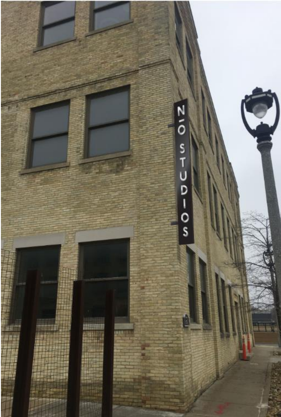
Rendering of proposed sign on the NE Corner