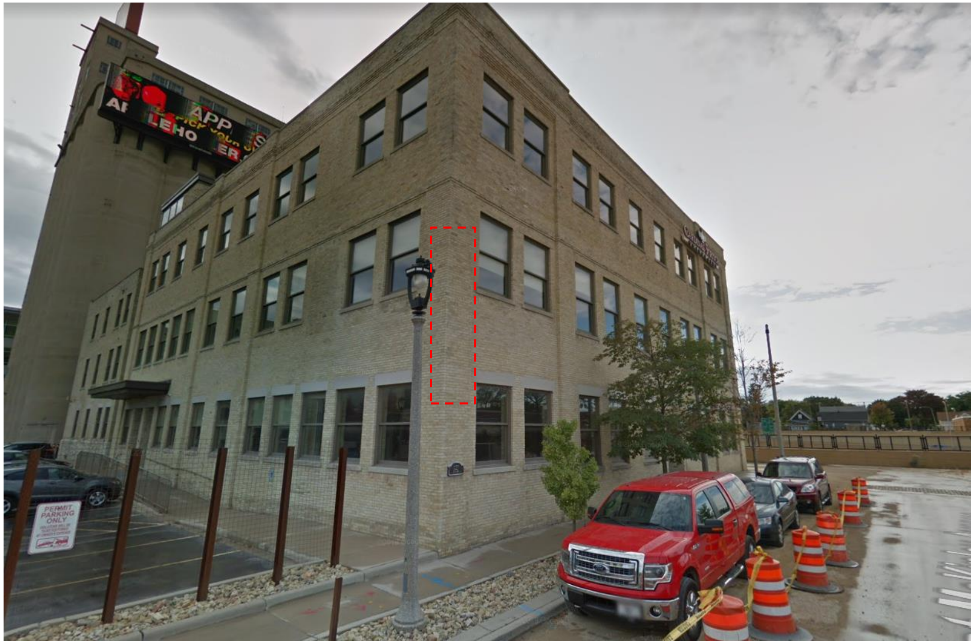
Building appearance ca. 2017 Looking SW (at NE Corner) Sign to be installed in region indicated in red