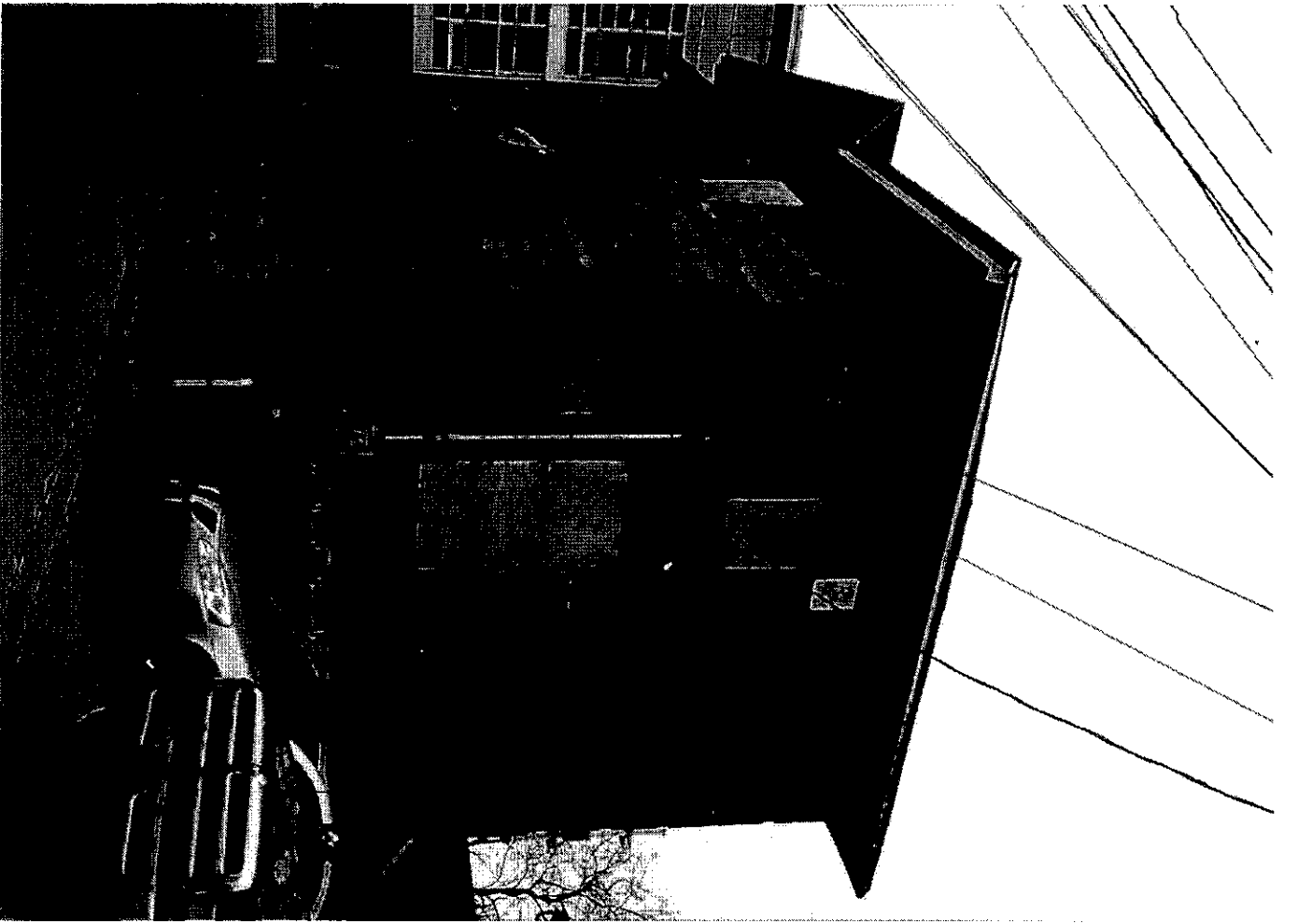
Rear elevation looking northeast. New plans for windows and doors to be furnished for staff review and approval.