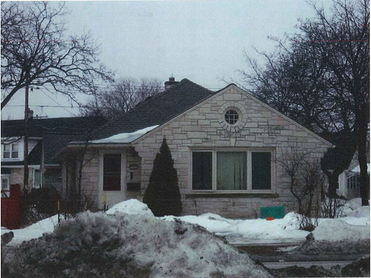
3845 W Forest Home