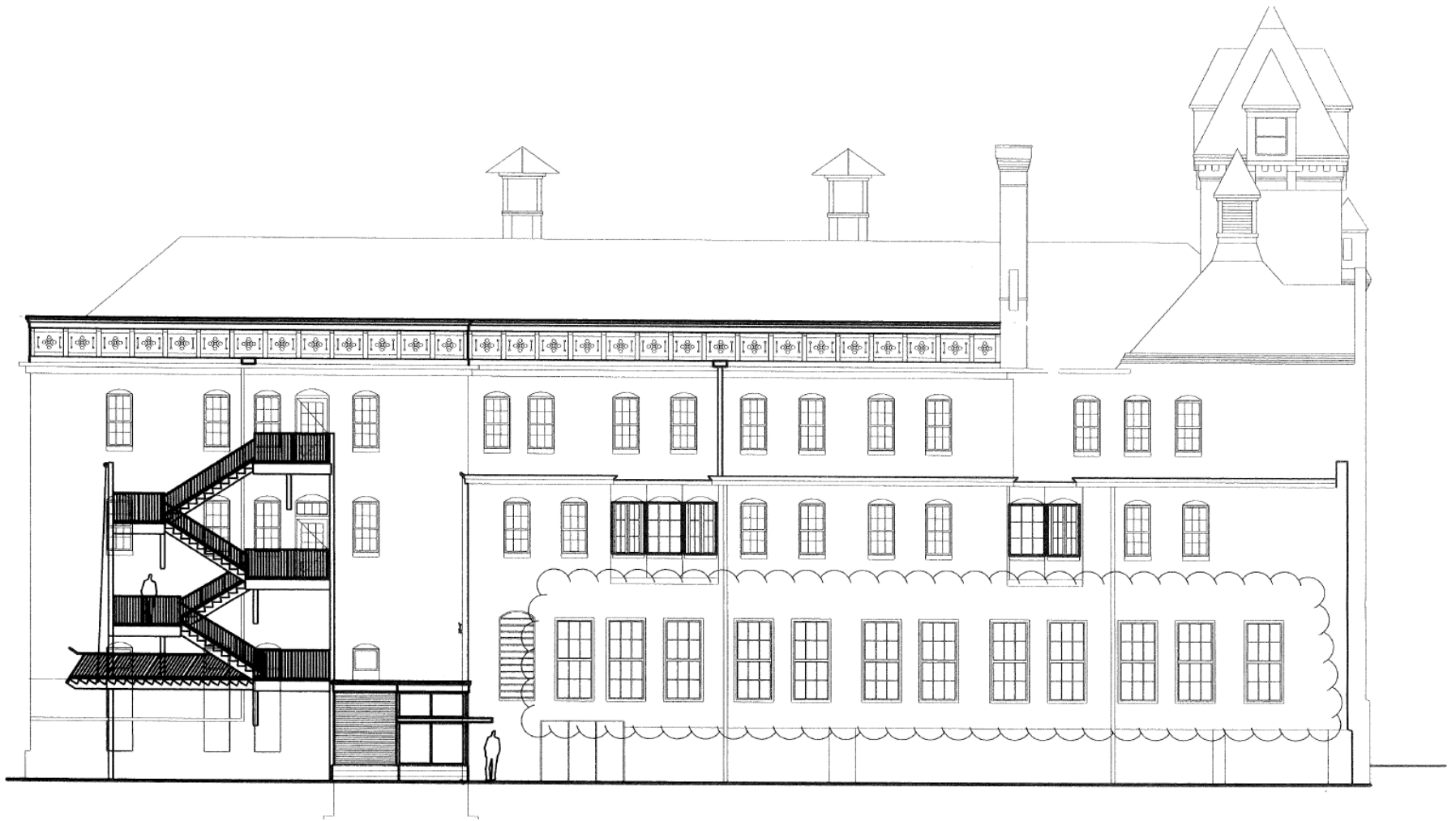
North elevation with subject windows in cloud.