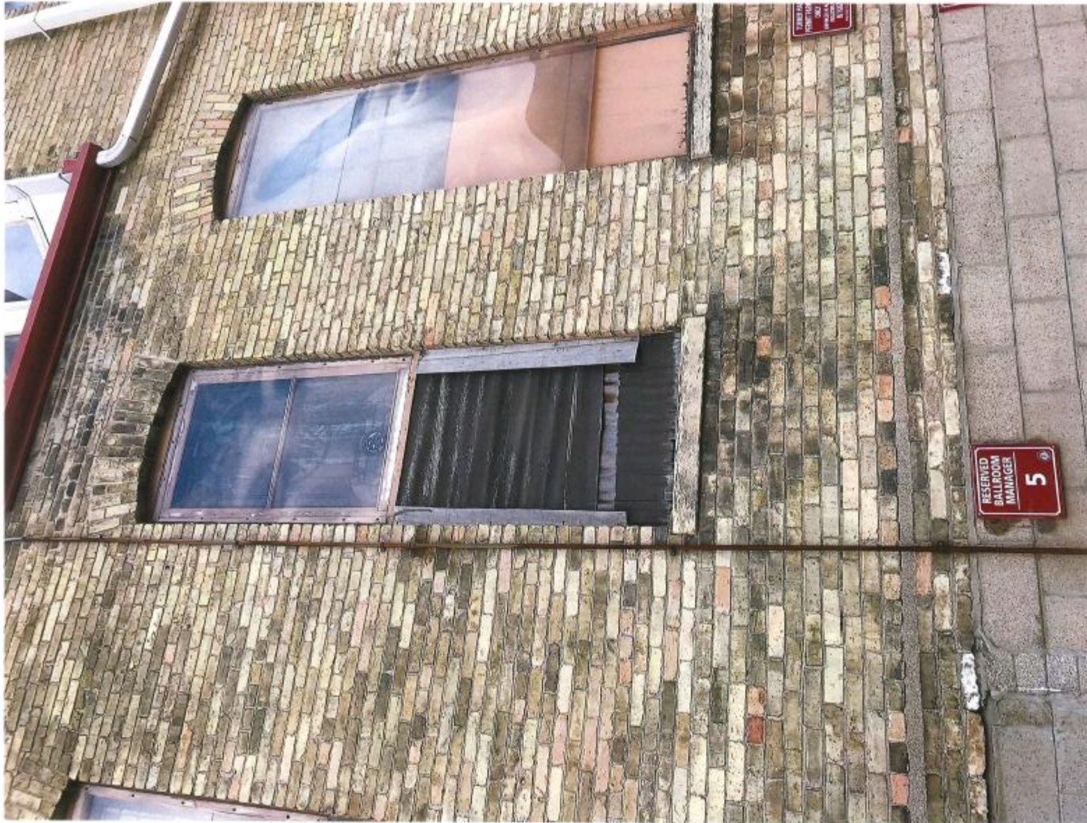
Typical existing conditions