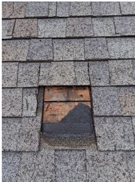
1 layer of asphalt roofing was found to be on the church currently.