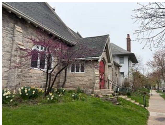
Pic shows new counter flashing system along roof wall intersection that I think was missed in overview of total feet of step flashing and counter flashing needed on the project. I have 202' in total of each on the project.