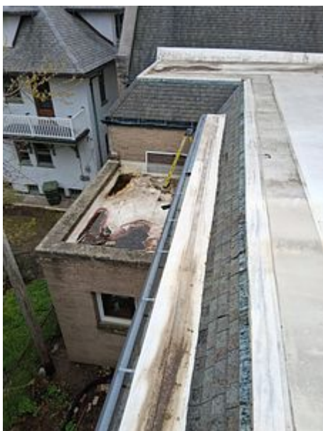
North-East roof facet that we will need to remove termination bar, fix roof, install new copper apron, and then reattach the existing termination bar. Did not see this scope of work in the insurance claim around copper apron work needed.