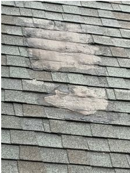
Section of the roof on the South-East roof facet that was damaged by the falling concrete cross