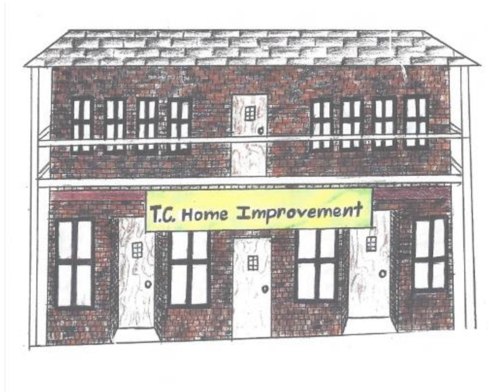
Conceptual rendering at 3720-24 West Vliet Street

The estimated renovation for the existing building is $50,000. The Buyer may pursue City of Milwaukee grant programs to assist with the project. Additional improvements may include new clear glass windows of appropriate proportion to fit the former openings, signage and exterior lighting on the street frontage. Most improvements will include the Buyer's sweat equity, due to his experience as a general contractor.