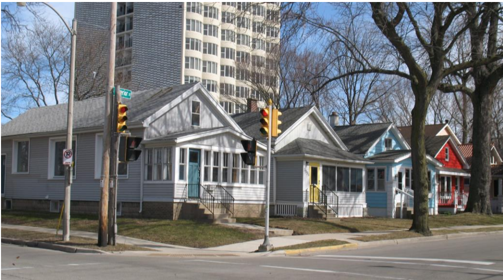
Same view taken March 14, 2021