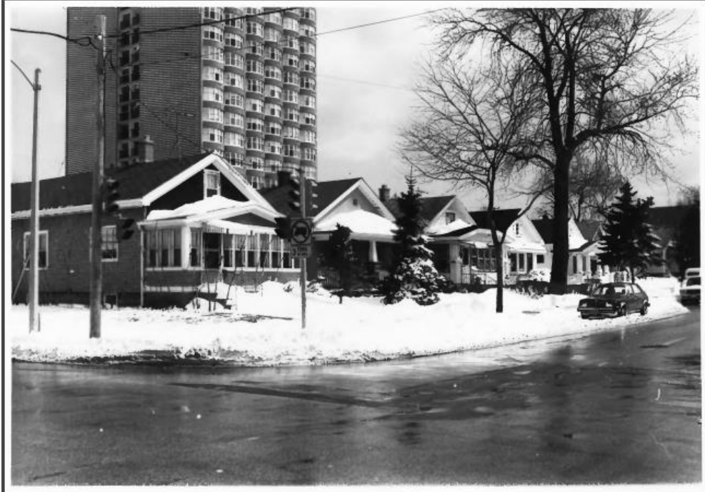
Bay View Historic District, Milw. Co., Milw. S. Superior St. View from NW. Photo by B. Wyatt, 3-82. Negative at SñSW, Madison, WI Photo #3 of 73.