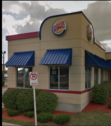
EIFS Used on Majority of Facade