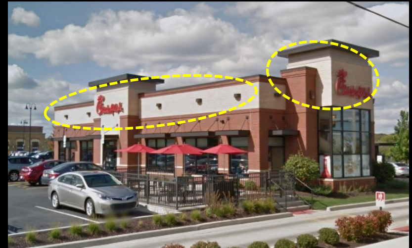
EIFS Used on Minor portion of Facade