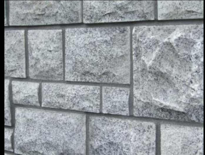
Regular Shaped, Coursed Manner