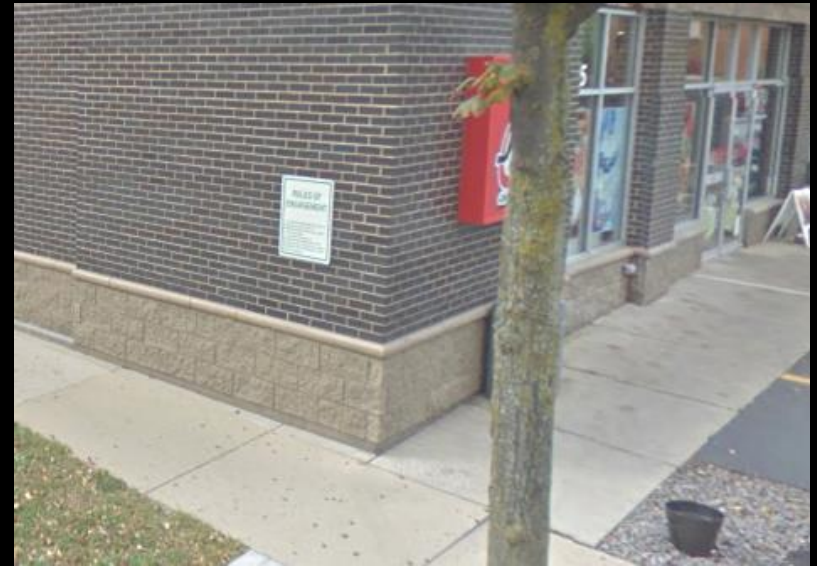
Split Face Used only at Base of Facade