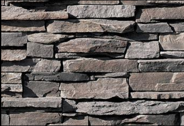
Irregular Shaped, Un-coursed Manner