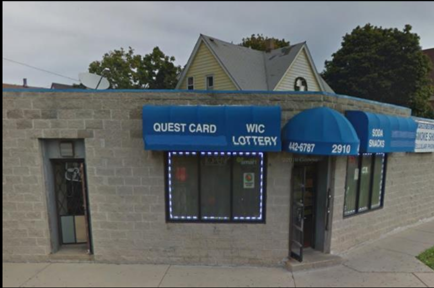
Utility or Split Face Used at Most of Facade