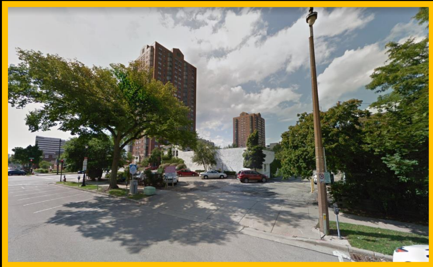
View from East Kilbourn Avenue looking north-west