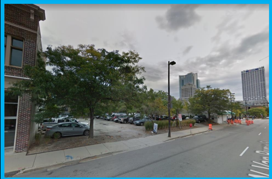
View from North Van Buren Street looking south-east