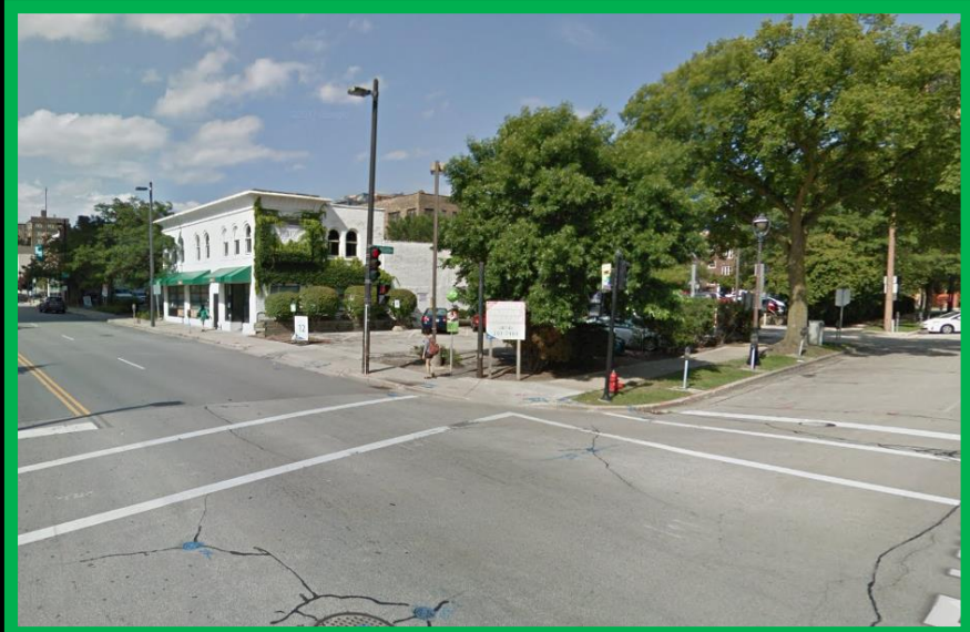
View from East Kilbourn & North Van Buren looking north-east