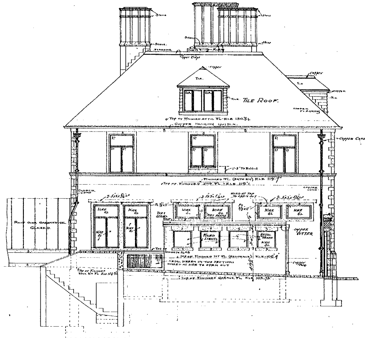
END ELEVATION - NORTH