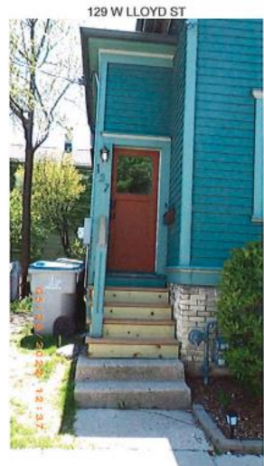
129 W LLOYD ST