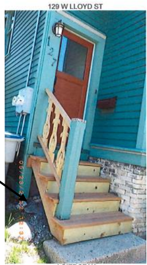
129 W LLOYD ST

Stoop here must include skirting that matches other steps on the property.