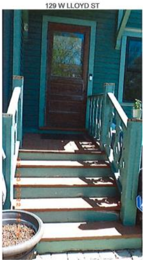
129 W LLOYD ST