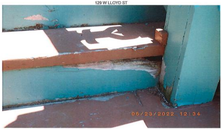
129 W LLOYD ST