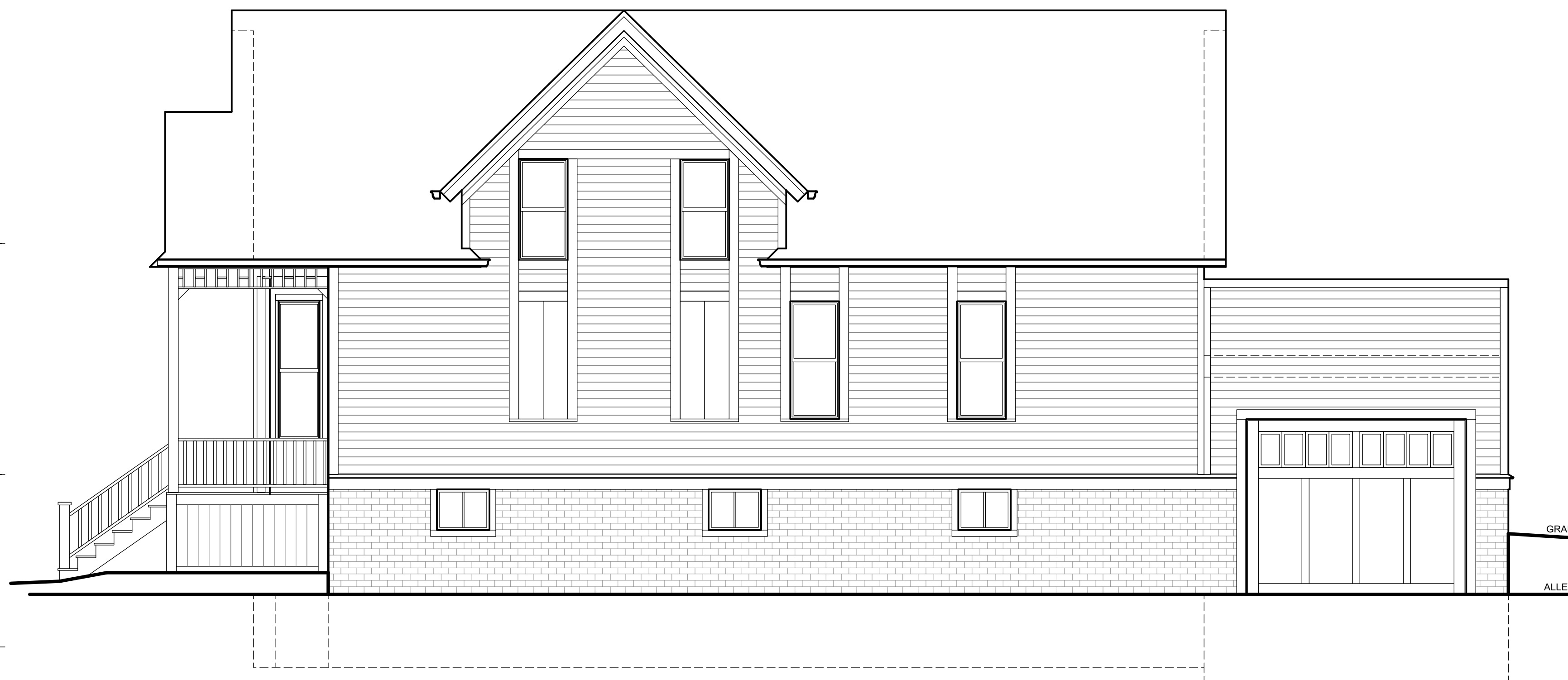
4 PROPOSED SIDE (WEST) ELEVATION - (ALLEY VIEW) SCALE: 1/4" = 1'-0"