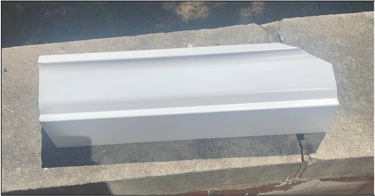
6" aluminum K-Style gutters to be installed throughout the house and painted red to match the house trim.