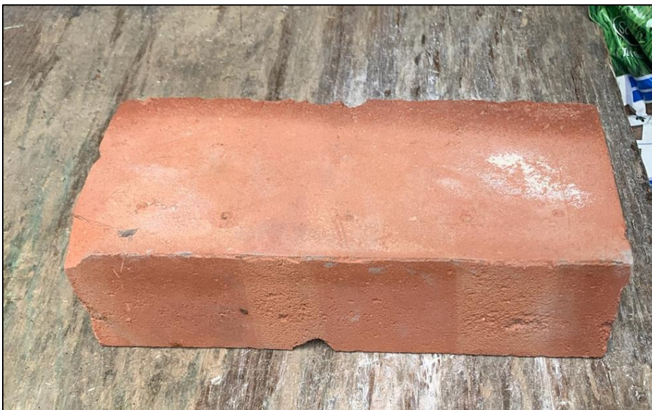
Reclaimed brick 3 ¾" x 2 ½" x 8 ½"