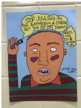
An anti-JUULing poster is on display in a Shorewood High School restroom.

The device is designed to be an alternative to combustible tobacco products, like cigarettes, and includes flavored JUUL "pods" that range from "Virginia Tobacco" to "Crème Brulee." JUULs, which are small and sleek enough to be easily mistaken for a USB, use a regulated heating element to activate ingredients and create an aerosol vapor that users inhale.