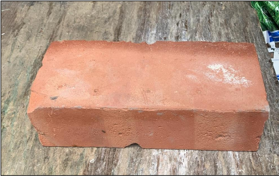
Reclaimed brick 3 ¾" x 2 ½" x 8 ½ "