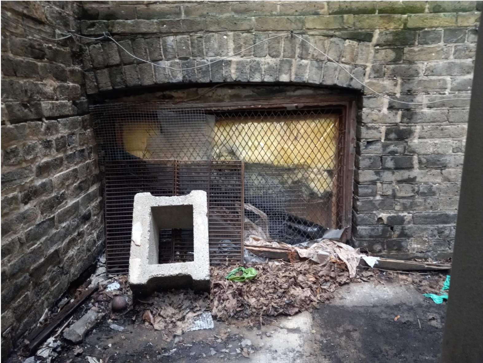
Window to be replaced.