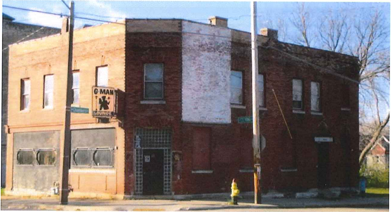
2977-79 North Martin Luther King Drive